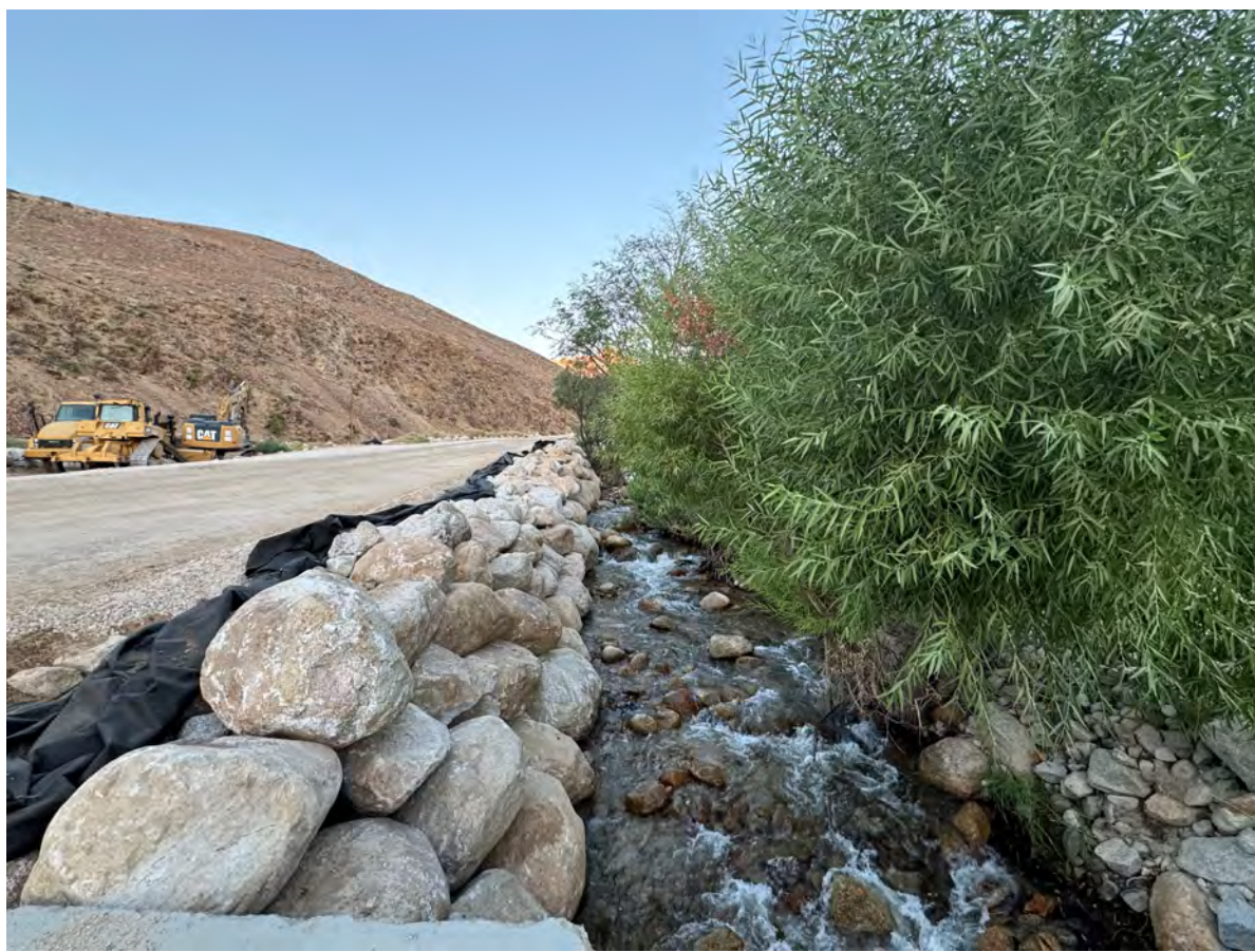
Image 5. Riprap Embankment Slope Protection - Station 658+50 Bk (Looking West)

Image 6. Riprap Embankment Slope Protection Complete - Station 658+50 Bk (Looking West)