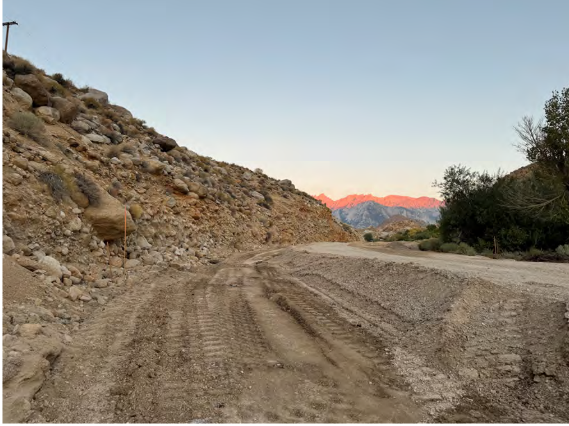
Image 7. Riprap Embankment Slope Protection -Complete Station 655+50 Ahd (Looking East)

Image 8. Embankment Construction - Sliver Fill Station 621+00 Bk (Looking West)