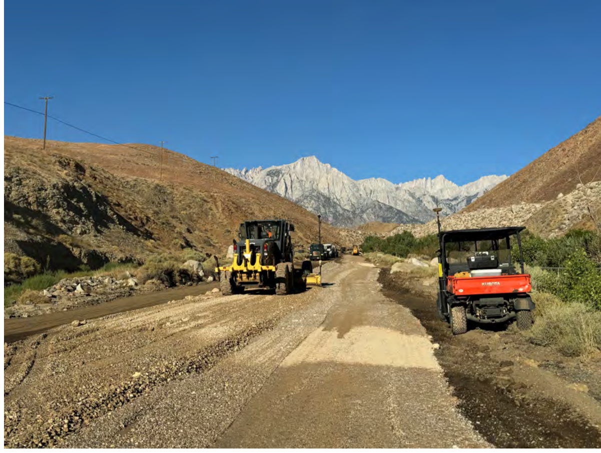
Image 4. Embankment Construction - Station 670+00 Bk (Looking West)