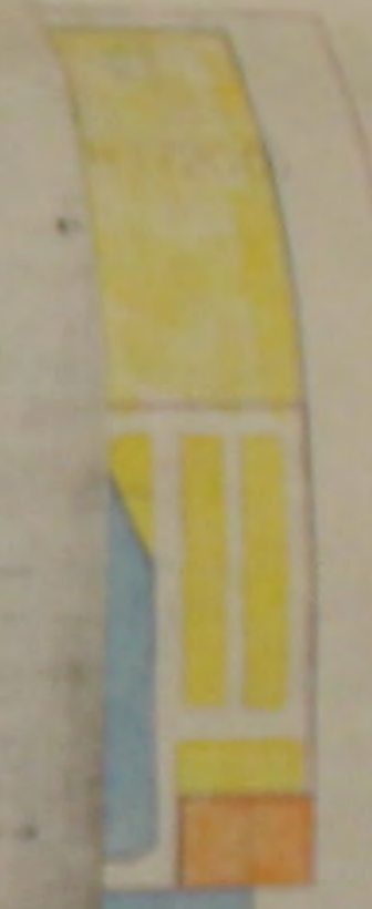
TOWN OF INDEPENDENCE

STATE OF CALIFORNIA COUNTY OF ALBUQUERQUE ZONING MAPS Adopted by the County Board of Supervisors May 20, 1978