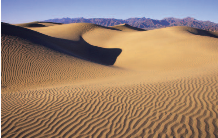
The sprawling Mesquite Sand Dunes, just outside of Stovepipe Wells Village.

Penetrating deep into Death Valley's Black Mountains is aptly named Golden Canyon. Especially in the morning light, the canyon walls glow magically with a flaxen hue. Golden Canyon is a hike, but one can get an intimate feel for it by walking just a few feet past its mouth. More adventurous trekkers can choose among a number of longer hikes. Located two miles south of Furnace Creek.