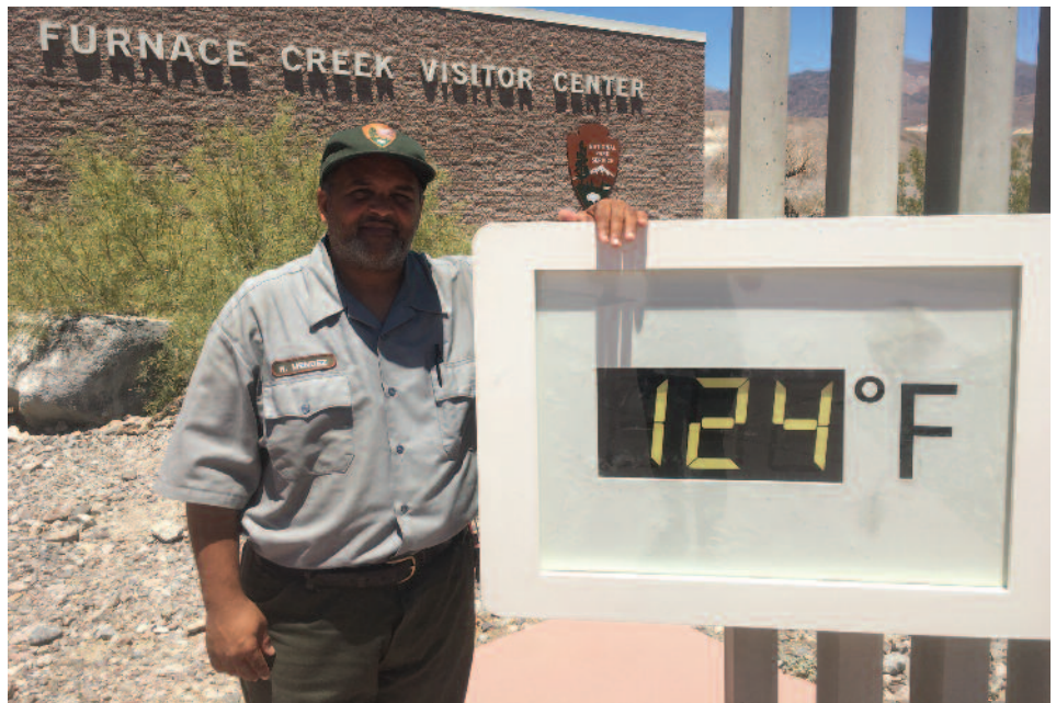
The temperature sign at the Furnace Creek Visitor Center confirms that “it’s hot in Death Valley.”

Watch for signs of trouble: If you feel dizzy, nauseous, or get a headache, get out of the sun immediately and drink water or sports drinks. Dampen