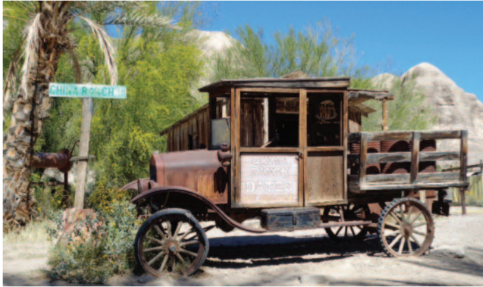
A hidden Oasis, the China Ranch Date Farm offers date nut bread, dates, date shakes and leads to the Amargosa River Canyon.

Inyo County is “The Other Side of California,” a vast expanse along the eastern edge of California that covers 10,000 square miles (16,000 sq. Km), an area greater than six U.S. states (VT, NH, NJ, CT, DL and RI).