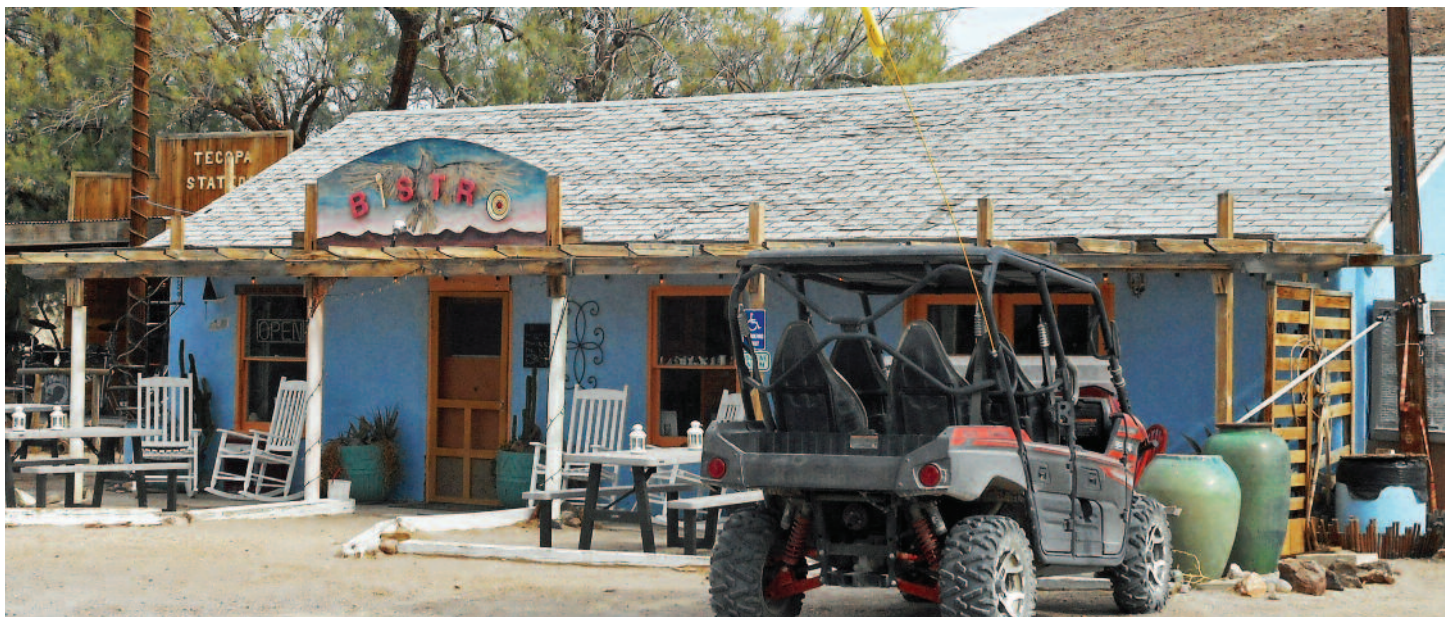
The Tecopa Bistro, where "The Old South Meets the Wild West." Gumbo and rattlesnake pizza? You bet.