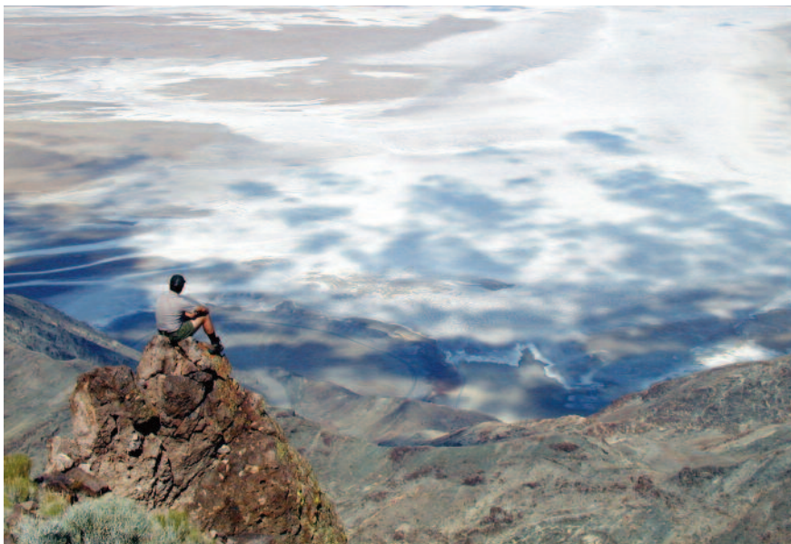
Dante's View overlooks Badwater Basin, the lowest elevation spot in North America.

There are short hikes that lead north and south of the parking area. There is no longer an observatory but primitive restrooms are located at a switchback about 1/4 mile before the top. Take a jacket, pack a snack or a meal, and spend some time at this magical Death Valley spot. You'll find the time you spend here very well worth it.