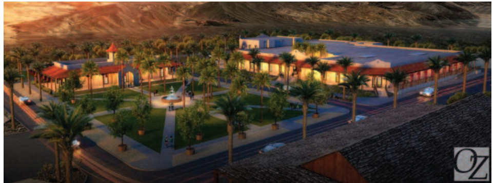
An artist's rendering of the completely new common area at Ranch at Death Valley. The Ranch's 224 rooms have been upgraded and refreshed.

Death Valley, the lowest elevation golf course in the world, has also been updated and offers golfers the opportunity to challenge themselves while playing their "lowest" round of golf – guaranteed. The course has added more desert landscaping and new contours to make the course more water efficient. The 19th hole continues to serve patrons via its unique golf cart drive-thru, which is a must-do for every guest, as is their world-famous hamburger.