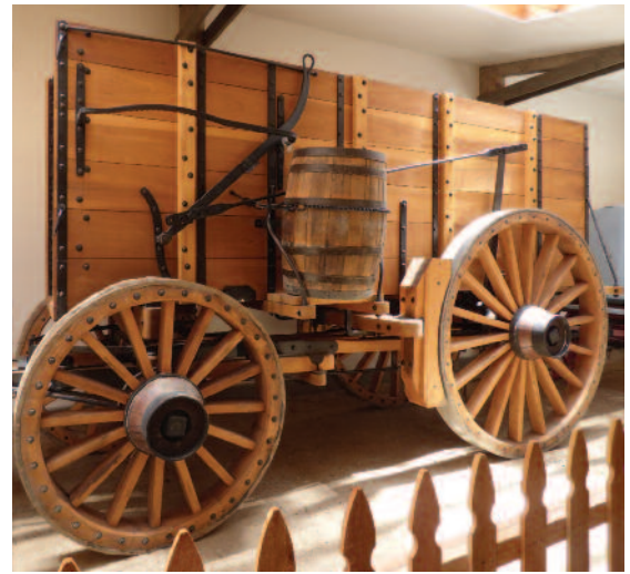
Two, huge Borax 20-Mule Team Wagons and trailing water tank at the new wagon barn at the Laws Railroad Museum.