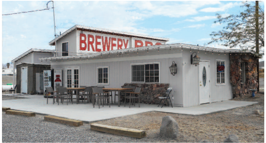
The Tecopa Brewing Company is a family operation featuring BBQ and locally crafted beer.