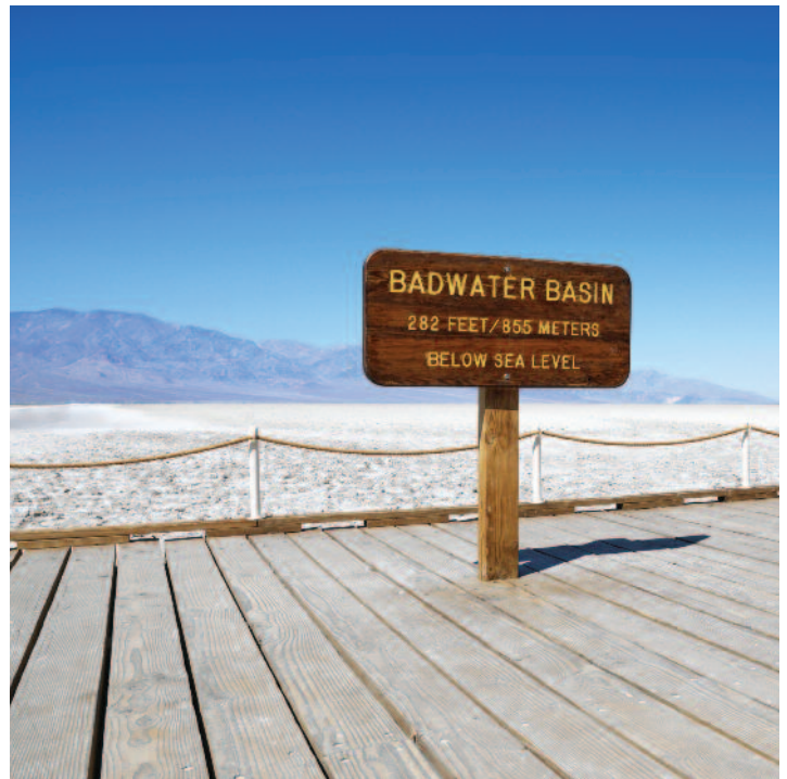
Badwater Basin is the lowest spot in North America, resting at 282 feet below sea level.