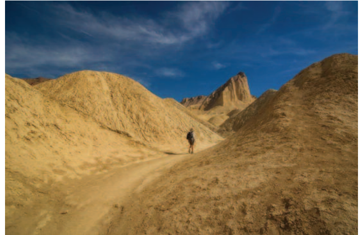
Golden Canyon lives up to its name. Shown is the hiking trail through the canyon and Manley Beacon.

This scenic one-way, semi-loop paved road twists, winds, climbs and dips its way through some of the most colorful scenery in Death Valley. Highlight of the nine mile trip is the Artist Pallate, where hues of greens, purples, oranges, browns and yellows blend together in a kaleidoscope of color. Entrance to Artist Drive is located about 10 miles south of Furnace Creek.