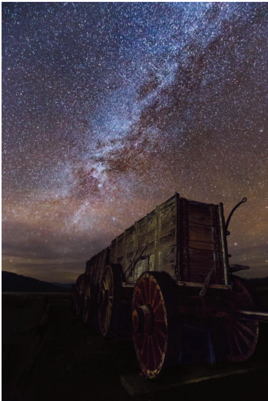
The bright night sky and the Milky Way shine above the Harmony Borax Works.

Death Valley National Park harbors some of the darkest night skies in the United States. That dark sky is key to its certification as the third International Dark Sky Park in the U.S. National Park System.