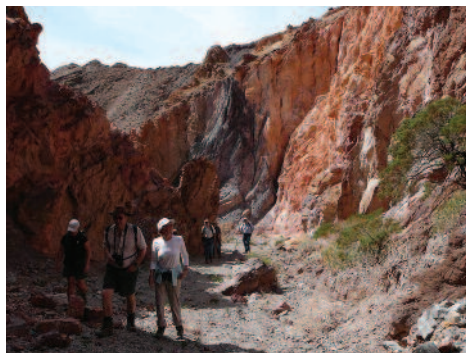
It's always a good idea to take water and friends when hiking in Death Valley.