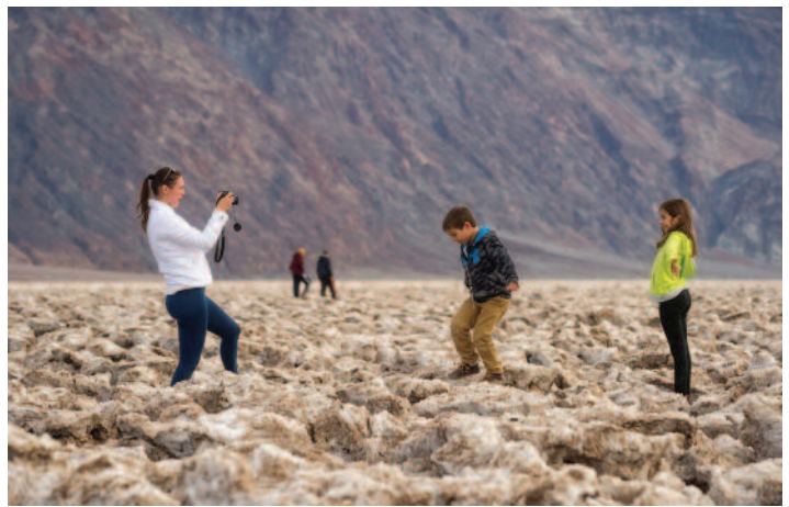
A family frolics in the Devils Golf Course.

One of the earliest American explorers described the Owens Valley as containing “ten thousand acres of fine grass.” Today, it is mostly arid. As told in Marc Reisner's book, Cadillac Desert this once-fertile farmland, populated with fruit trees, was the victim of California's Water Wars of the 1900s in which water rights to the Owens River were obtained by Los Angeles. Today, a third of LA's water comes from the valley through the LA Aqueduct. Court rulings and actions by the Los Angeles Department of Water and Power have helped restore fish habitat along the river, making it again one of the finest fly fishing streams in the West.