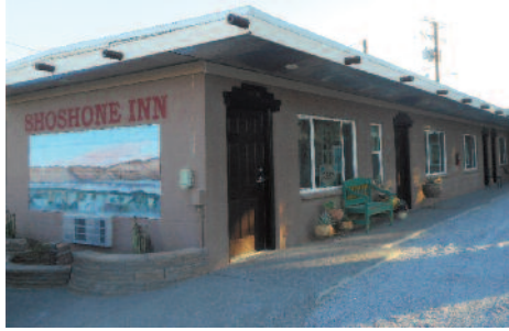
The recently remodeled Shoshone Inn offers a touch of comfort in the desert.

Tecopa is also rich in hiking opportunities, most notably the Grimshaw Lake Natural Area and watchable wildlife site, and the Amargosa Canyon. Accessing the extraordinary desert vistas of the Amargosa