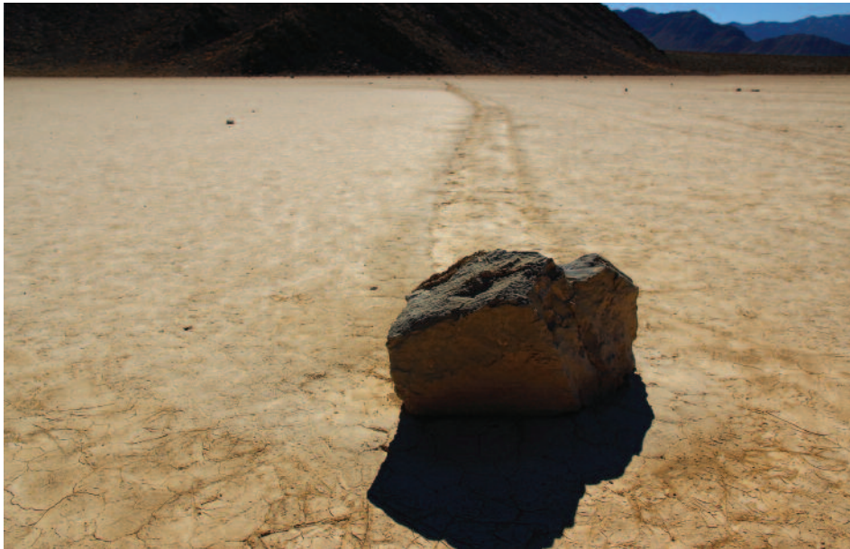
This rock leaves its trail across the Racetrack Playa.

The Playa is located 27 miles north of Ubehebe Crater on a fair dirt road. Depending on recent weather, the road can be quite rough and is not recommended for ordinary passenger cars. Check with the Rangers for current road conditions before heading out. Be considerate of others and do not walk on the play if it has rained recently. Footprints will be left in the soft mud that will last until the next big rain. Walk onto the play only during dry conditions.