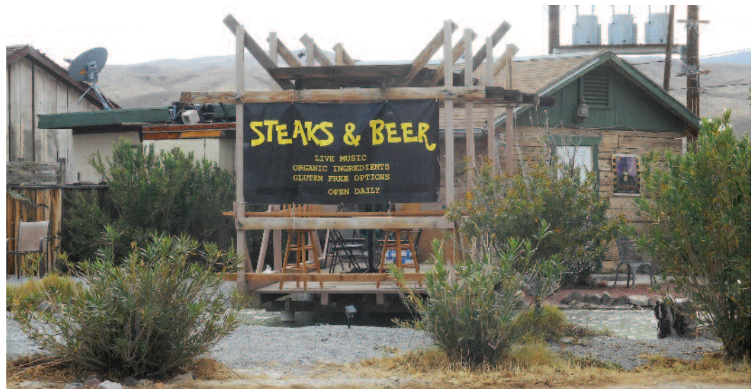
A Las Vegas chef runs Steaks and Beer with attention to detail and quality.