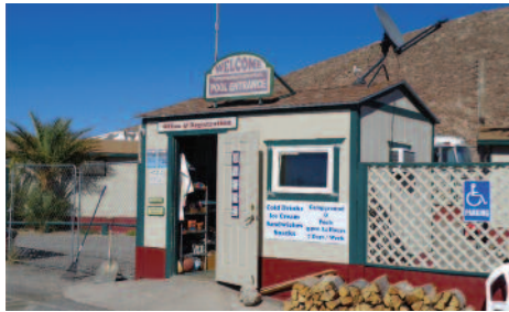
Tecopa has four hot springs resorts offering a variety of rejuvenating experiences.