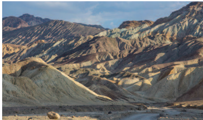
Instead of yet another Devil-related name, the scenic canyon behind the Furnace Creek Inn was named 20 Mule Team Canyon to link it with the Borax Company's famous, widely recognized soap products, even though Borax was not mined in the canyon, and the 20 Mule Teams never visited.

But Harry Gower also understood the huge marketing potential if they could promote the use of its magic soap product Twenty Mule Team Borax through the appeal and romanticism of