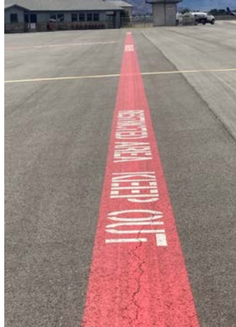
Image 6. SIDA Marking