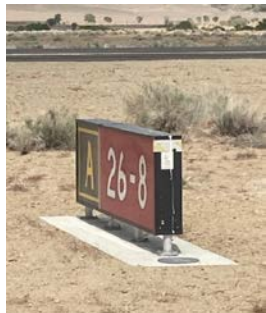
Image 15. Runway Hold Position Sign