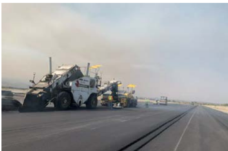
Image 14. Paving operations on Runway 12-30

Extra vigilance is essential when driving on an airport during construction. Normal driving routes may be altered, large equipment may limit visibility, hazards such as open excavation may be present, and operational changes may be required. For all of these reasons, heightened awareness by pilots and drivers alike is required. Additionally, any unsafe practices observed relating to maintenance or construction on the ramp should be reported to Airport Operations at 760-872-2971 .