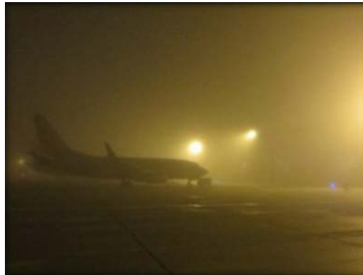
Image 12. Low visibility

Under winter conditions, lights, signs and markings may be obscured by snow. Braking action will be greatly diminished and all surfaces will be slippery due to the presence of ice, snow, slush and even de-icing fluids. Snow removal equipment may be operating in low visibility conditions and may not see your vehicle. Use extreme caution and remember that there are extra risks present.