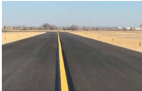
Image 4. Taxiway centerline

The taxiway centerline provides pilots with continuous visual guidance to permit taxiing along a designated path. It is a continuous yellow marking that provides pilots with the location of the center of a taxiway. It also ensures pilots of wing tip clearance on both sides of the aircraft.