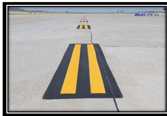
Image 5. Taxiway Edge Marking

The only taxiway edge markings at BIH are located between Taxiway A and B and the main apron. Aircraft may cross this line, but must be aware that they are transitioning from ramp to taxiway. This marking also indicates entry into the Movement Area, therefore those with Non-Movement Area driving privileges may not cross.