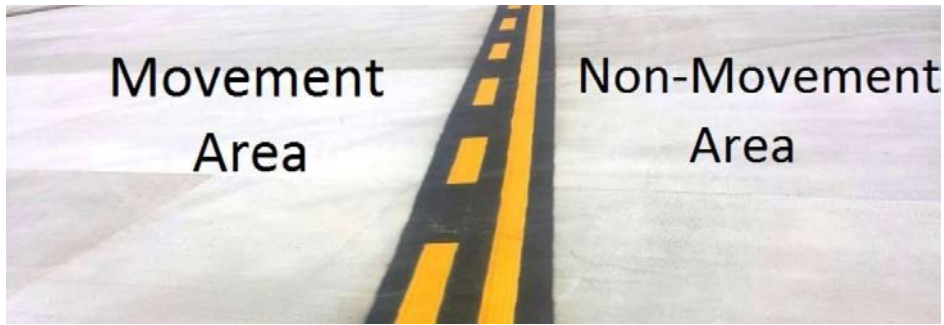
Image 3. Movement Area Boundary