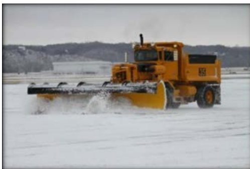
Image 13. Snow Removal Operations