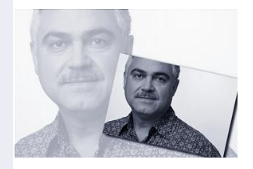
Information for Consumers